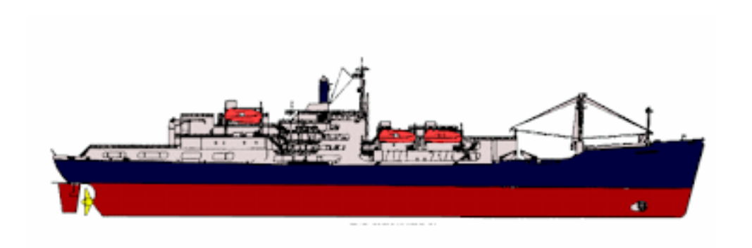
Summer Sea Term 2023